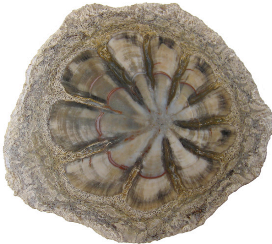
Hermanophyton taylorii Jurassic; Morrison Fm; Brushy Basin Member East McElmo Creek, Cortez, Colorado