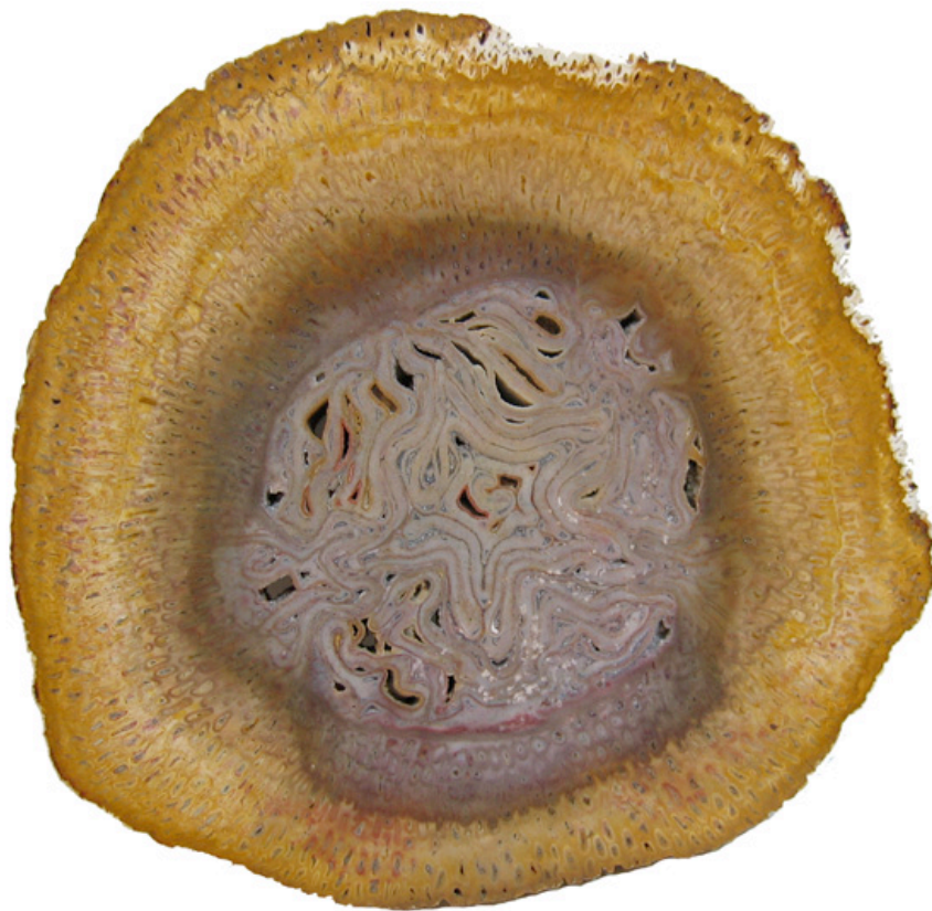
Tree Fern Psaronius brasiliensis Permian; Pedra de Fogo Formation Bieland, Maranhão Province, Brazil