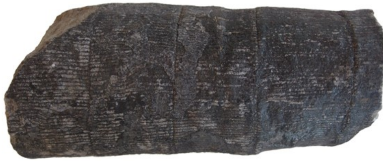
Calamites Pith Cast (Steinkern)

Sometimes a shell can be filled with minerals and then dissolve away. The internal cast that remains is termed a steinkern, which in German means "stone cast" (Pothero, 1998, p. 7). Steinkerns are most often represented by the internal molds of mollusks. The pith cast of Calamites is the most common plant steinkern. As a Calamites tree matured the