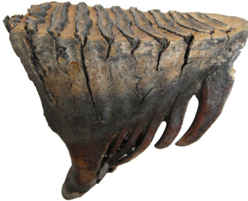
Mammuthus primigenius molar

The concept of unaltered remains can refer to multiple modes of preservation. Freezing, encapsulation in amber (tree resin), desiccation, and chemical preservation, such as entombment in petroleum containing sediment, are examples explored in our museum. The term unaltered remains is a bit misleading. It does not mean that the organism is unchanged. Nucleic acids (DNA and RNA), proteins, pigments, and soft tissues may be degraded. Tissues, if present, have usually lost water. However, organic matter that is present has not changed into another substance. Freezing, mummification (desiccation), oil seeps, and amber can preserve both soft and hard tissues. Sometimes the soft tissues decay, but the hard parts remain unaltered. Teeth, bones, and shells may be preserved in this way. Forty thousand year old bones encased in the asphalt of Rancho La Brea in Los Angeles retain their original composition. Mollusk shells of the Pleistocene are known that retain their mother-of-pearl aragonite layer. Even some Cretaceous aged mollusks are found with their aragonite intact (Prothero, 2004, p. 9).