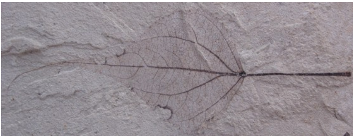
Carbonized Poplar Leaf Exhibiting Marginal Feeding

Leaf mines are meandering tunnels produced by the feeding larvae of some beetle, fly, and sawfly species. The first definitive leaf mines first appear in the leaves of Triassic conifers and pteridosperms. Interestingly, the abundance and diversity of fossil leaf mines coincides with the radiation of flowering plants (Angiosperms) during the Cretaceous. Leaf mines have been used to establish the persistence of insect and plant associations. For example, the larvae of certain moth families have been eating the leaves of Quercus (oak) and Populus (poplars) for 20 million years and hispine beetles have been eating the leaves of Heliconia for 70 million years (Grimaldi & Engel, 2005, p. 52).