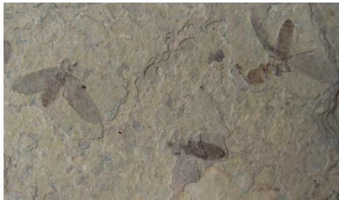
Carbonized Insects Insect Compressions

When organisms become trapped and squeezed between sediments they may form compressions. Larger organisms can be distorted by compression. However, good fossils of fish, leaves and insects are often formed by compression.