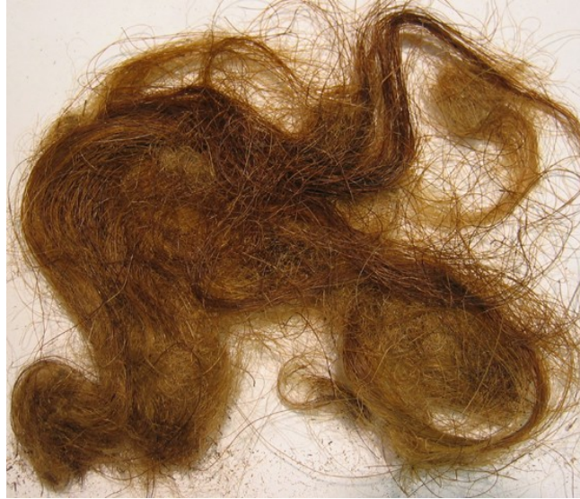
Mammuthus primigenius Hair

Woolly mammoths and woolly rhinoceroses from the Pleistocene can sometimes be found in the permafrost of Alaska and Northern Siberia. The entire organism is sometimes preserved in this frozen soil.