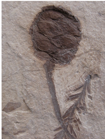
Cone & Needle Compression of Metasequoia

Insects and leaves preserved in the Eocene aged Florissant beds of Colorado are often carbonized. It is believed that leaves and insects became entangled in diatom mucus mats (formed by aggregates of diatoms under stress). Insects and leaves were incorporated into layers of sediments and volcanic ash at the bottom of Lake Florissant. Many of these insects and leaves decomposed leaving imprints. As the sediments compacted and hardened into shale the imprints became impression fossils. Some organisms only partially decayed retaining a dark colored carbon residue to become compression fossils (carbonization). Many insects have their wings preserved as impressions and their bodies as dark compressions. Compressions are often flattened, having a two-dimensional appearance. However, the preservation in diatom layers allows some organisms to retain their three-dimensional character. Some insects are found with organs and appendages. Some leaves can be found with internal structures (Meyer, 2003, pp. 35-37).