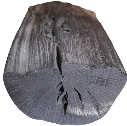
Fusainized Lithocarpus sp.

responsible for the original feather color. The fact that the structure of the melanosomes is preserved opens up the possibility of determining the original feather color (Vinther, J., 2008, p. 522).