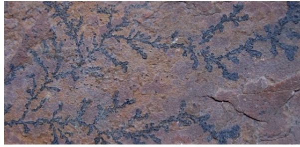
Manganese Dendrites on Sandstone

Pseudofossils are objects that do not have a biologic origin, but may be mistaken as a fossil. Mineral and rock patterns of inorganic origin formed purely by natural geological processes may be mistaken for fossils. Dendrites deposited by mineral rich water percolating through rock layers may have the appearance of a well-preserved plant. Concretions may look like eggs or other objects that have a biologic origin (Ivanov, Hrdlickova, & Gregorova, 2001, p. 10).