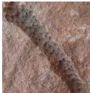
Ophiomorpha (Shrimp-Like Organism) Burrow

Trace fossils representing marine environments are used to determine animal behavior as well as establishing the type of sedimentary environment in which the rock formed. In fact, marine trace fossils are often classified into behavioral categories; does the trace fossil represent resting, dwelling, crawling, grazing or some other type of feeding behavior (see Prothero, 1998, p 406 for more details)? Perhaps the most practical way to classify marine trace fossils is by their associations with a particular sedimentary environment or ichnofacies. In marine environments different ichnofacies are associated with different water depths, physical energies (wave & current conditions), or even type of substrate. Ichnofacies have become a standard tool for sedimentary geologists as well as paleontologists (Prothero, 1998, p. 406).