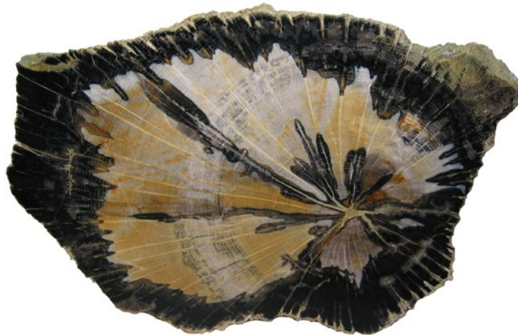
Permineralized Oak Quercus sp.

Permineralized fossils form when solutions rich in minerals permeate porous tissue, such as bone or wood. Minerals precipitate out of solution and fill the pores and empty spaces. Some of the original organic material remains, but is now embedded in a mineral matrix