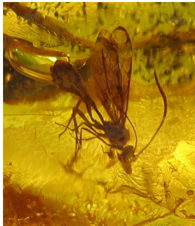
Wasp in Baltic Amber

Amber is referred to as petrified tree resin or sap. I prefer petrified tree resin as the term sap refers to fluids transported by xylem or phloem tissues (Raven, Evert, & Curtis, 1981, p. 659). Conifers and some deciduous trees produce resin in response to injury. Resins are viscous liquids that contain volatile terpene compounds and organic solids. Under the right conditions resins polymerize and harden with age, turning into copal. After several million years or more, copal matures into amber.