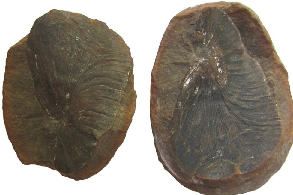
Siderite Nodule with Seed Fern Leaf

Exquisite examples of leaves, stems, cones, and seeds of Carboniferous plants along with animal life can be found in the Lagerstätten known as Mazon Creek, which is just 150 km southwest of Chicago, Illinois. The soft and hard parts of plants and animals are replaced with the mineral siderite (iron carbonate). Subtle pH changes created by the decaying body of the buried organism caused available iron carbonate to precipitate. Thus, the organism became its own nucleation site for the formation of a siderite nodule. When these nodules are split open, the fossil appears as a 3-D external cast and mold. Mold surfaces may be coated with kaolinite, pyrite, calcite or sphalerite. Plant material is sometimes covered with a carbonaceous film (Nudds & Selden, 2004, p. 120).