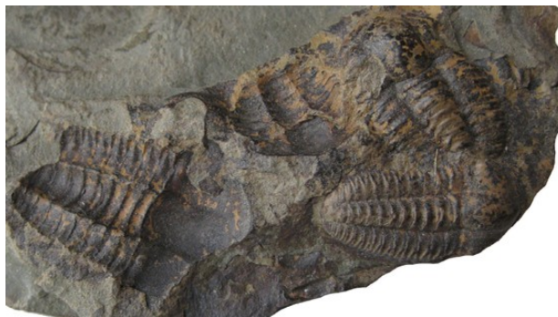
Casts & Molds of Trilobites Ellipsocephalus hoffi

Organisms buried in sediment may decay or dissolve away leaving a cavity or mold. If the space is subsequently filled with sediment, an external cast can be made. Molds and casts are three-dimensional and preserve the surface contours of the organism. A mold