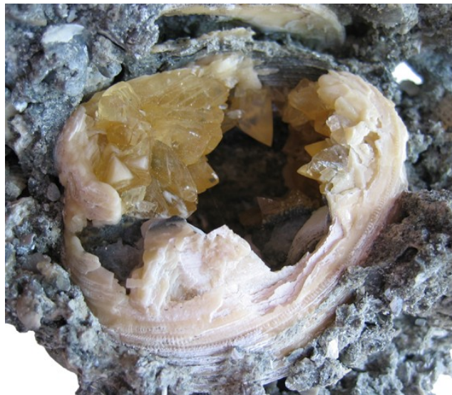
Recrystallized Fossil Clam Mercenaria permagna

Some shells are made of aragonite. During the fossilization process aragonite reverts to a more stable form of calcium carbonate called calcite. Thus, recrystallization from