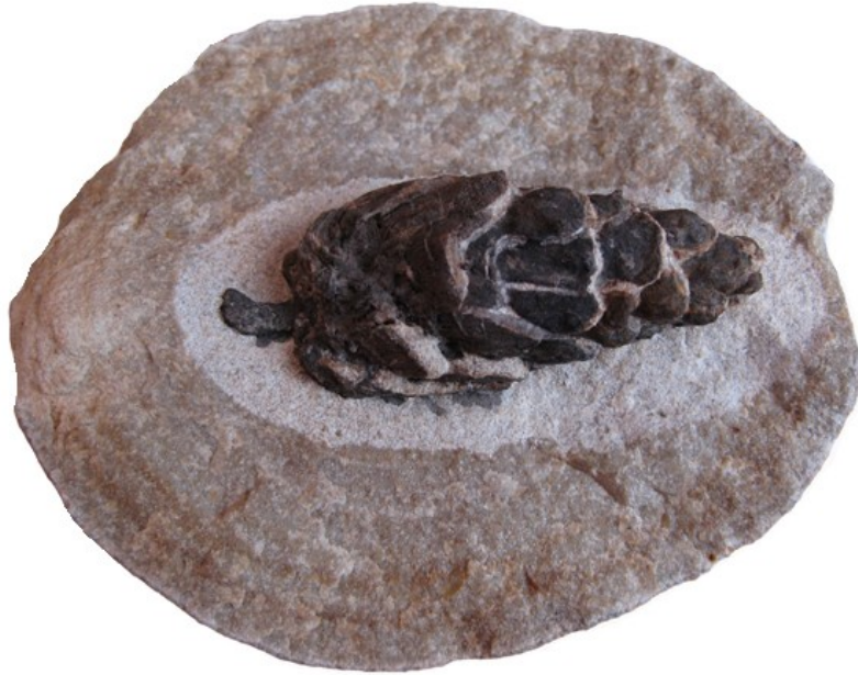
Cone Cast in Barite Nodule

The process that forms a concretion or nodule, which may contain a replacement fossil, is called authigenic cementation or authigenic mineralization (Prothero, 2004, p. 437; Cleal & Thomas, 2009, p. 7). Authigenic minerals grow in place rather than being transported or deposited. Thus, the concretions or nodules are found in the place they formed or in situ (Latin for "in the place").