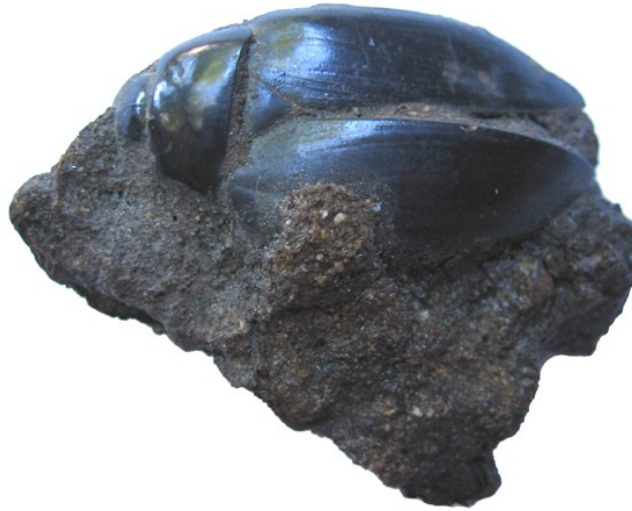
Hydrophilus beetle in Tar Sand