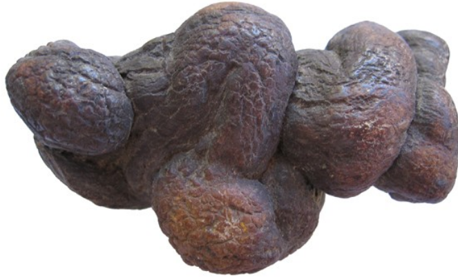
Salmon Creek Pseudocoprolite?